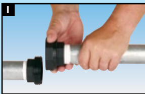
1. Disconnect current pipe