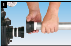
1. Disconnect current pipe from pump.