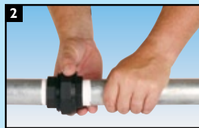
2. Connect new pipe to pump.