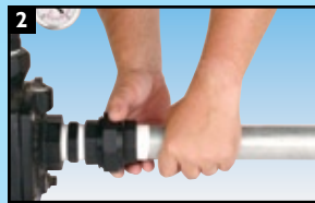
2. Connect new pipe to pump.