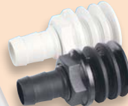
Male Tank Fitting - White - STF(W) Male Tank Fitting - Black - STF(B)