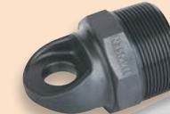
Tow Eye - HTE