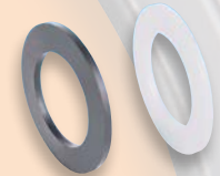
Male Tank Fitting Washers: