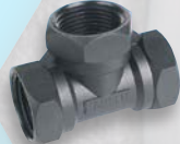
Female Threaded Tee - ST