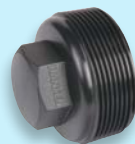
Tank Plug - TP