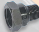
Male Female Adaptor - SMFA