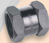
Hex Socket - SS