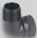
Male/Female Threaded Elbow - SMFE