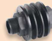
Female Tank Fitting - SFTFT* Female Tank Fitting - SFTFT(RW)*