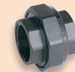
Barrel Union - SBU