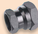
Reducing Hex Socket - SRS