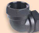
Female Threaded Elbow - SE