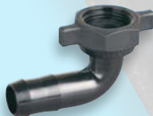
Nut & Tail Elbow - SNTE