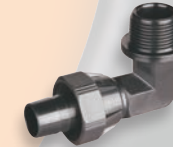
Male Bend Short - HMBS