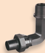
Male Bend Long - HMB