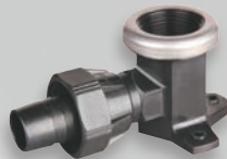
Bracket Elbow - HBE