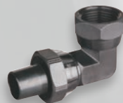
Female Bend - HFB