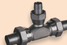
Reducing Tee Connector - HRT