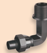
Reducing Male Bend (Long) - HRMB