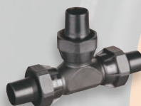
Tee Connector - HT