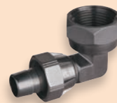
Reducing Female Bend - HRFB