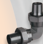
Bend - HB